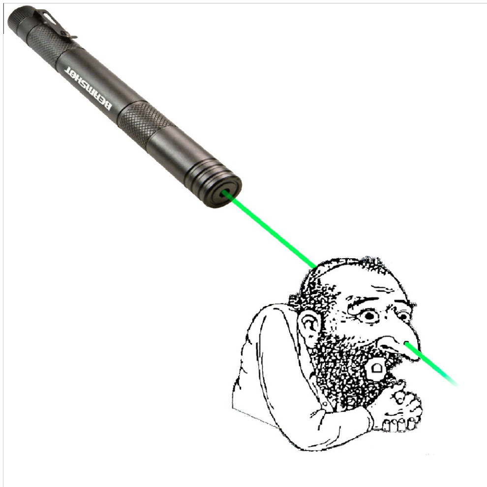
The jew fears the outdoor camera destroyer